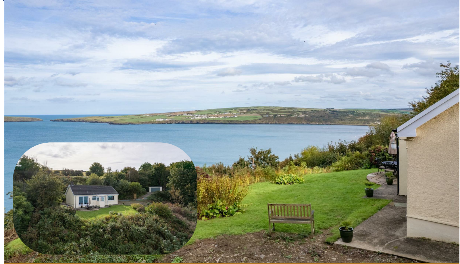
Gwylan Cottage Poppit, Cardigan, Pembrokeshire, SA43 3LP